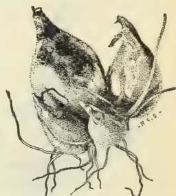
FIG. 1.— Muscari plumosum , showing that the reproduction in this variety is similar to that of a daffodil

The third method of reproduction is by seed. This method is applicable to all species except such as Muscari comosum , which is sterile. But in the case of M. azurea there is little or no reproduction of a vegetative character, and the only practicable way to increase stock is by seed (fig. 3).